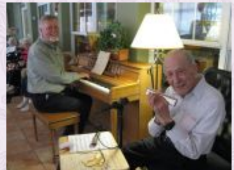
Music soothes the soul!