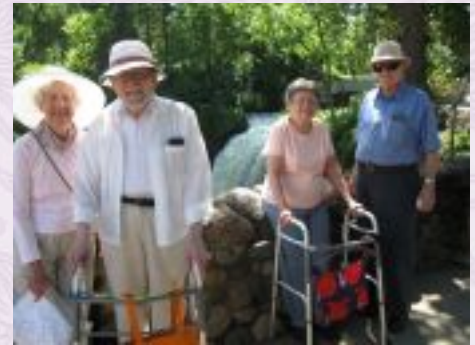
Picnic @ Minnehaha Falls

Mother's Day is set aside to honor and celebrate mothers, grandmothers and mothers-to-be. Shower the special women in your life with love, hugs and maybe a card or a beautiful bouquet! From all of us at MainStreet Lodge, we wish all the moms who call our community home a very happy Mother's Day!