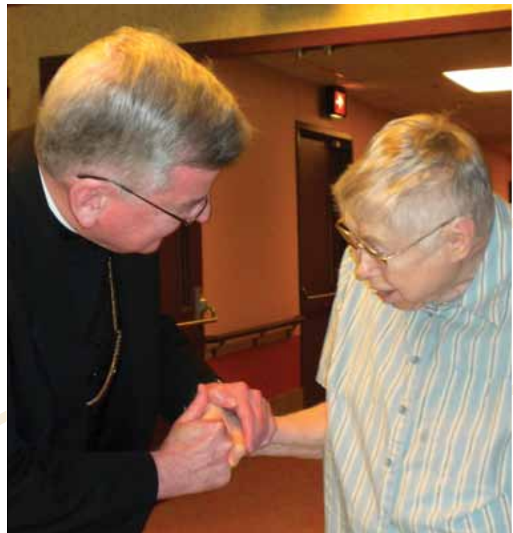
The Archbishop visited with many residents during his tour of the nursing home.